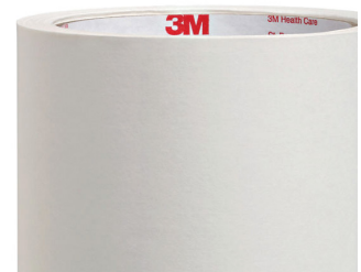
ADHESIVE SOLUTIONS SUCH AS SOLVENTUM 1510 / AVERY 445